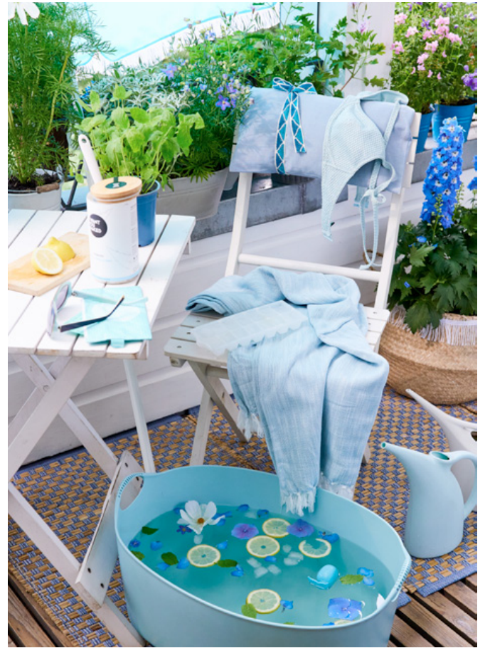
cool position with cooling,realxing foot bath with, salt, mint, citron and flowerleaves