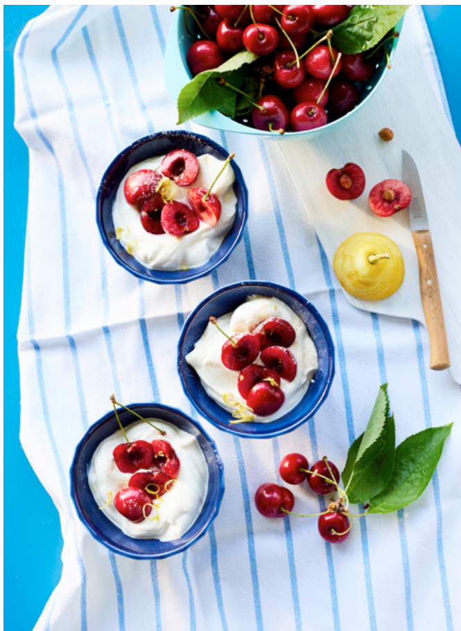
yogurt with vanilla,citrus and cherrys