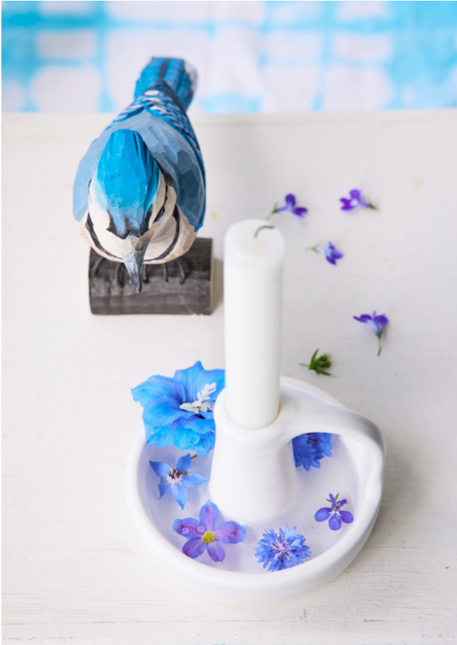
jay and blue