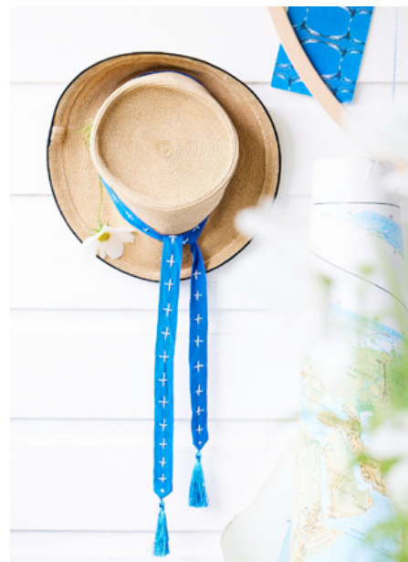
Diy Ribbon with simple stitching