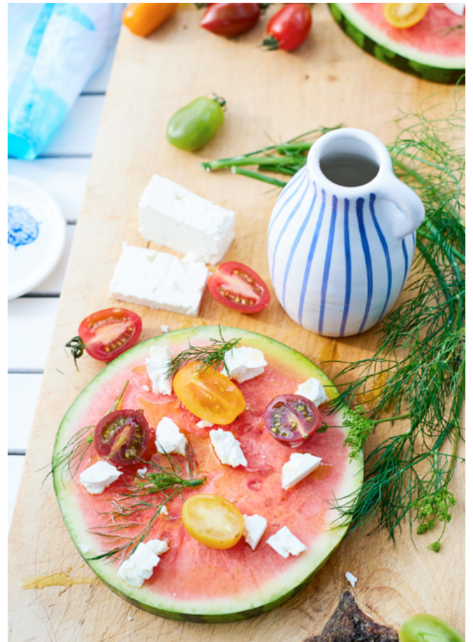
cool summer melon pizza with tomatoes,dill and sheencheese