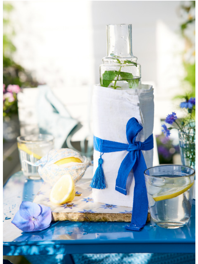
Bottle cooler Diy from Coolpad and Napkin