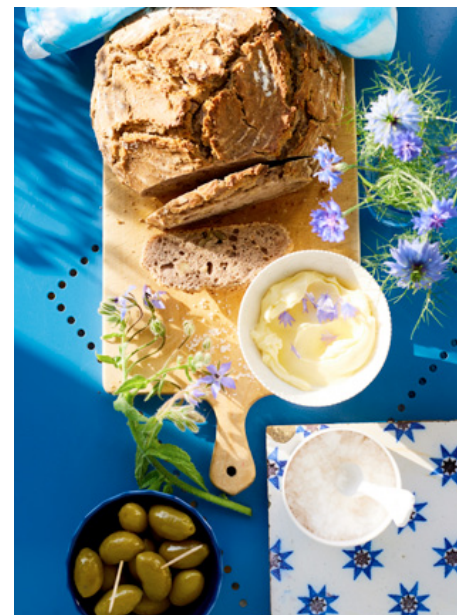
Homemade Sourdough-Walnut-bread with Borage-flowers.Receit needed?????