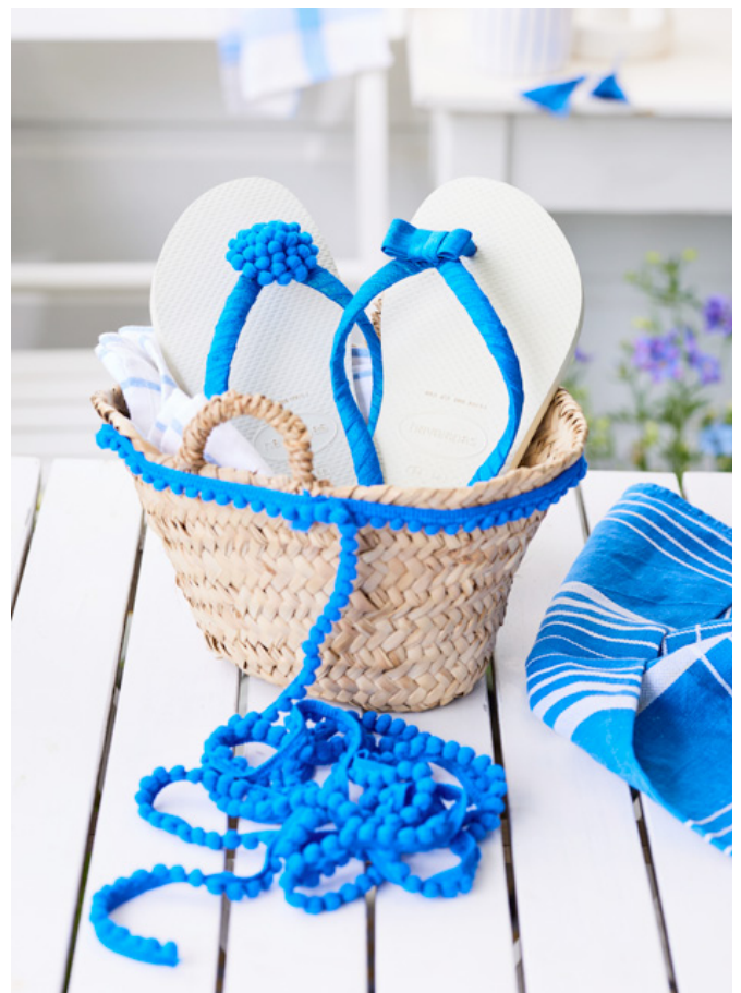
diy-flip flops with wrapped satinribbon and pom-pon-flower