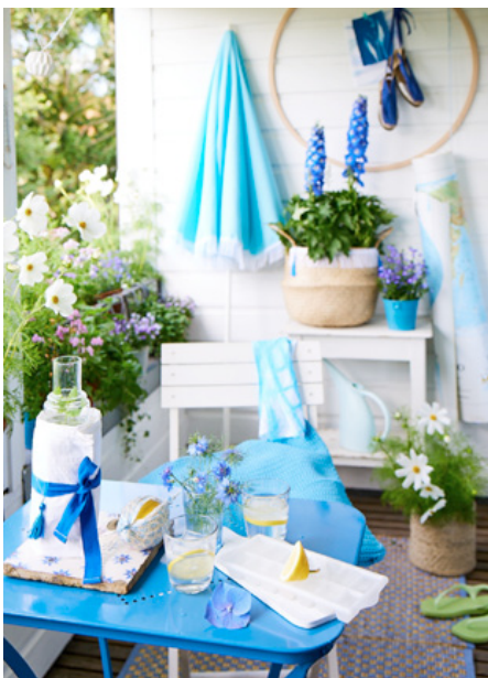
Summer on Balcoy, umbrella with diy fringed borders