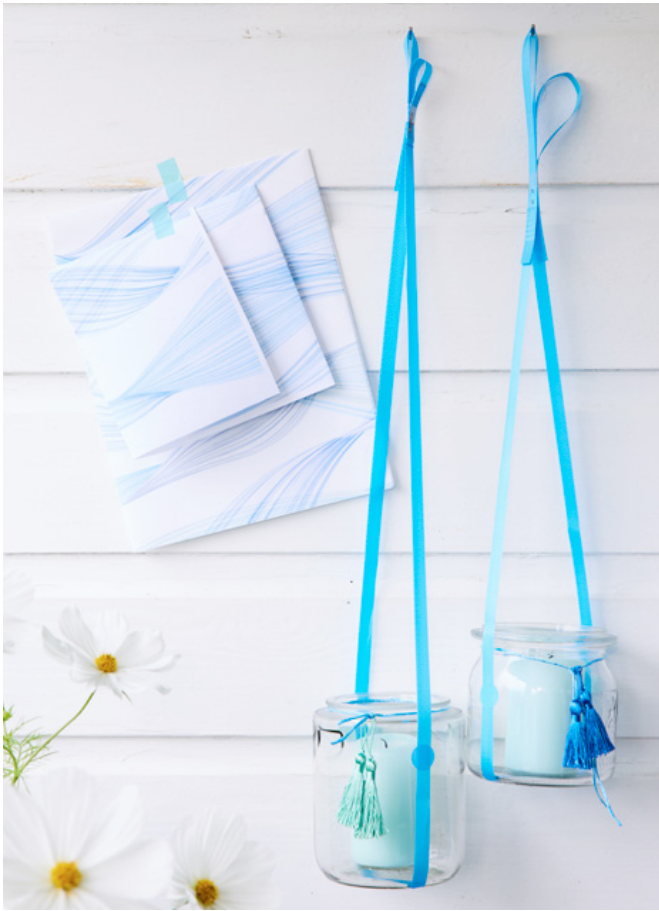
Diy-upcycling lantern with package plastic ribbons and mason-jars